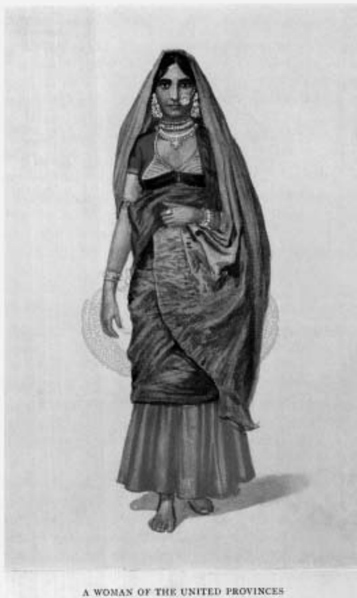
A WOMAN OF THE UNITED PROVINCES